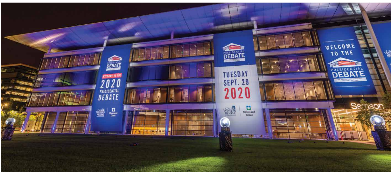
Opposite page left: Ohio Statehouse; Opposite page right: Cincinnati State Technical and Community College; Above: Health Education Campus, Case Western Reserve University and the Cleveland Clinic