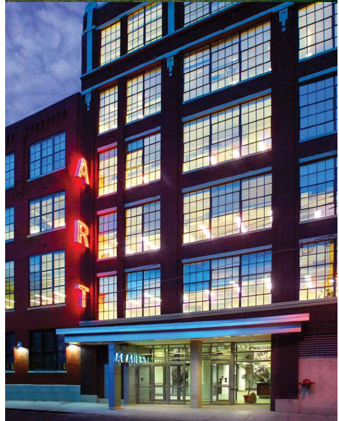
Top: Clark State College; Bottom: Art Academy of Cincinnati